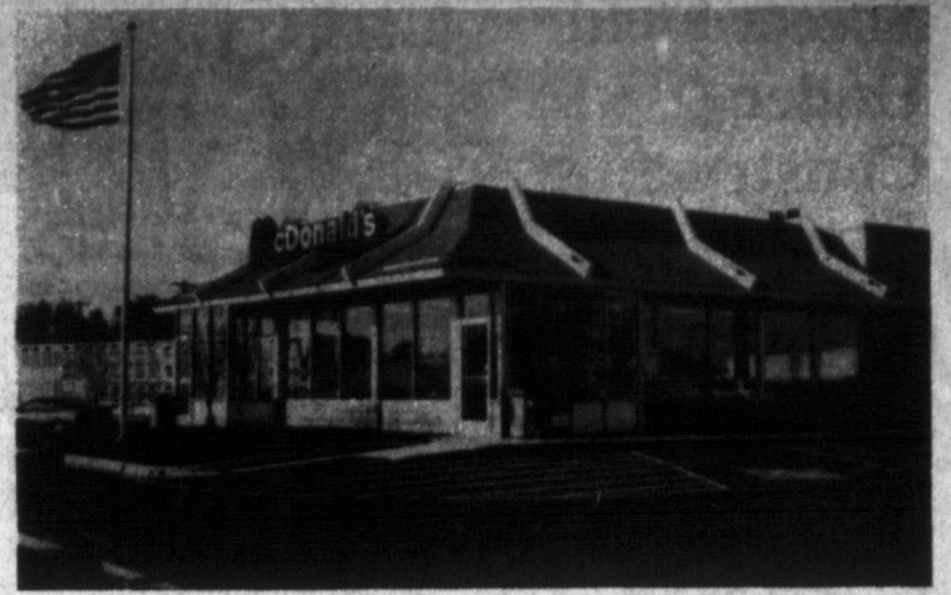
THE NEW ELECTRIC MCDONALD'S in Shamrock has installed new energy saving devices. West Texas Utilities participated in the testing of the new devices.

For more information about new energy efficient devices, call West Texas Utilities.