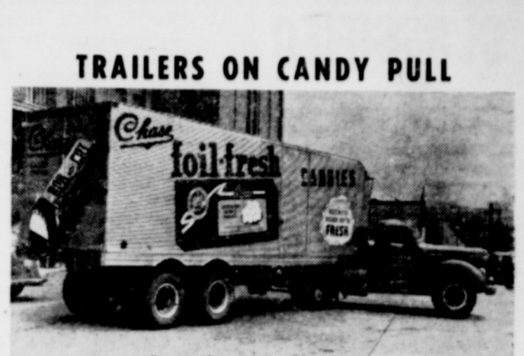
To coordinate operations at their St. Louis, Chicago and St. Joseph, Mo., plants, Chase Candy Co. last year put three insulated stainless steel trailers in service. As a result production zoomed and sales kept pace, showing an increase of 3 1/2 million dollars for the second half of the year over the corresponding period in 1946. The Fruehauf trailers are on the road night and day carrying 28000-pound payloads over the 1100-mile route. Insulation provides constant protection for the candy in any weather.