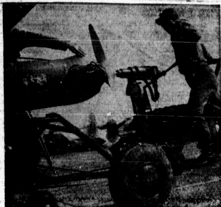
CONTACT! A 12-foot RCAT (Radio Controlled Aerial Target) gets its engine started preparatory to taking off as a pilotless "clay pigeon" for the Army's antiaircraft artillerymen on the firing range near Grafenwehr, Germany. It can simulate all the evasive action of an airplane by radio direction from the ground.