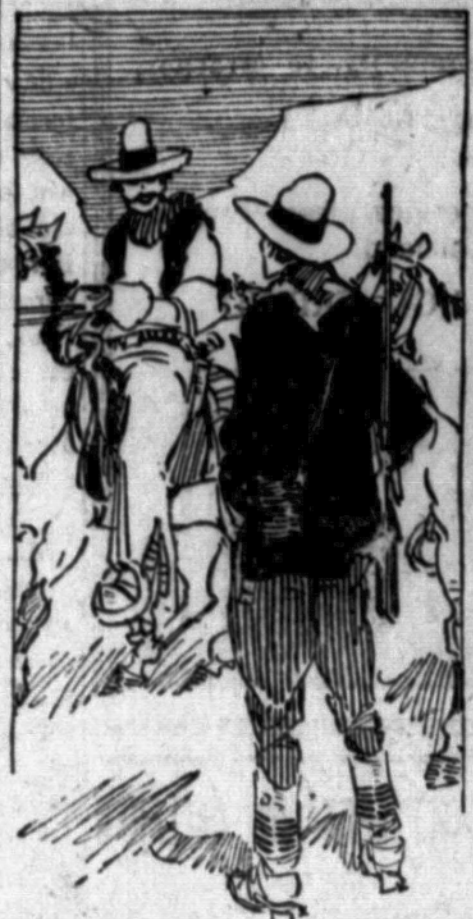
"You Are Not of the Wolves' Den."

He wheeled his horse and rode off on a sharp trot and the Mexican followed. Neither man so much as glanced back toward Shelby, seemingly indifferent as to what he chose to do. Yet he knew the customs of the West and that if he failed them now he would lose forever the confidence of the saddle and rode gleefully forward behind Juan. The cattle were still out of sight ahead, but they could hear the calls of the drivers. Shelby pressed his bronco up closer to the Mexican, who had lit a cigarette. "Is it far, Juan?" he asked. "Nom de Dios! I heard you not. To the hole you mean? Not far, but rough, senior; yet there is no other way to get cattle in." "The man with you; who is he?" "Juan omitted a cloud of blue smoke in the air, snuffing pleasantly. "Senior Laud." "Senior Laud?" "Laud!" in undesignated astonishment. "What Laud? Not 'Indian Joe'?" "SI, senior; they call him that," confidently. "He verra bad man. You know been, what?" Shelby gripped himself tightly. "I've heard of him, that's all. He's a Sioux squawman, but I never knew what he looked like before." His pony, no longer tired, fell back, trailing at the rear of the others. Juan rode on, unconscious and indifferent, blowing spirals of smoke into the air, and humming the strain of some Spanish melody, but Shelby was staring beyond him at the red-headed white man slouched down in his saddle. So that fellow was "Indian Joe" Laud! As never before he realized to the full the danger into which he advanced.