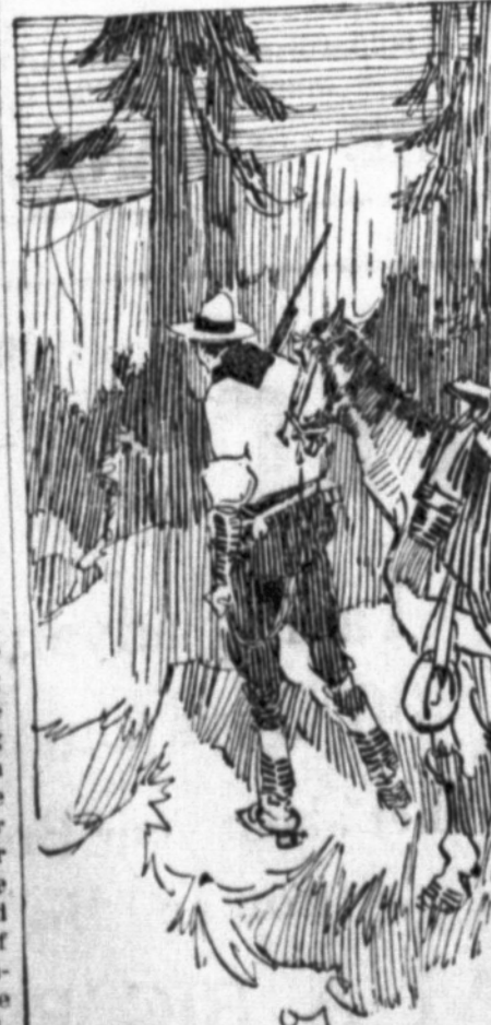
He Circled the Two Groves.

The camp appeared deserted, as though the party which had halted there had already passed on. He could hear no sound, see no movement. The fire had died down into a mere glimmer of red ashes, barely perceptible amid the surrounding gloom. Shelby