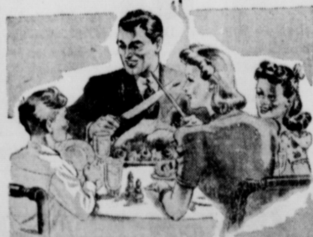
Today we give thanks that this same American Way of Life has survived and shown progress as each year passes.