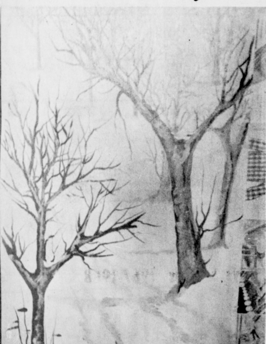
TREE SCENE---High school art students are painting tree designs over a snow background as one of their projects. Branches, limbs and trunks of trees are being reproduced for a natural looking landscape. This scene is one created by Allen Smyer.