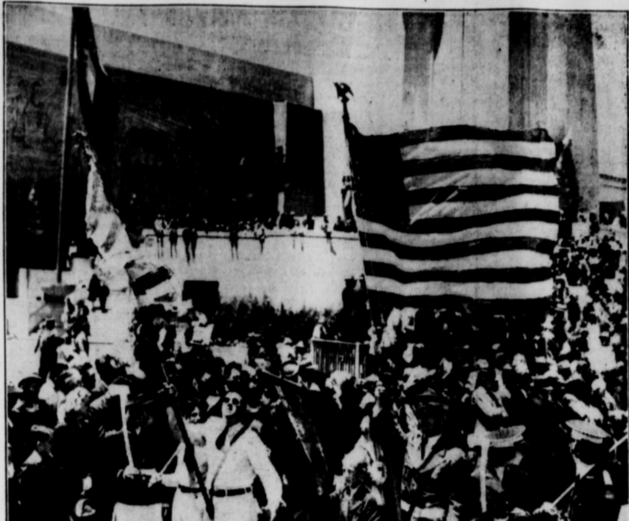
Here's part of the 131,000 Treasure Island visitors who participated in patriotic rites at the Golden Gate International Exposition on Independence Day. Color and pageantry predominated throughout the day, which was filled with parades and ceremonies and fireworks of a patriotic nature.