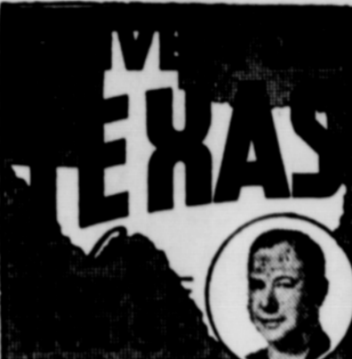
Have you ever seen a billion dollars walking? Well, I have, I have (paraphrasing the sentimental song of a few seasons ago about a walking and talking dream). This billion dollars, of course, talked—because we all know that money talks.

The billion dollars in breeches was Harry Sinclair, probably the most important individual in the domain of oil in all the world and certainly the most picturesque personality in petroleum.