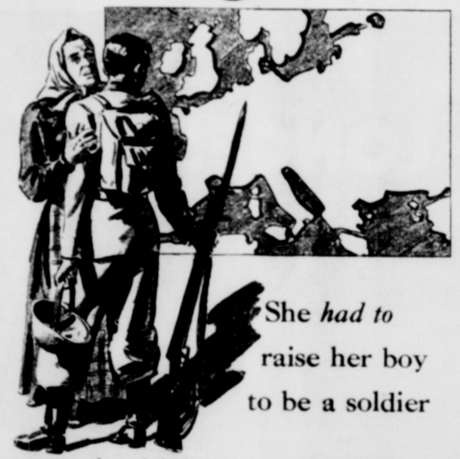
In many lands today, mothers are forced to give up their children—even the youngest. Dictators demand them—and dictators are all powerful. In peace as in war, they control business and industry, capital and labor, life itself. Men and women are told what work they must do. There is no prize for ambition, no hope for the man who would like to choose his own career.

By all means, do your duty. Give agency that we can all agree on to h