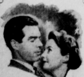
Fred and Barbara—two great romantic stars in the screen thrill you'll never forget!

Presenting BARBARA Stanwyck FRED MacMurray in "REMEMBER THE NIGHT" with BEULAH BONDI