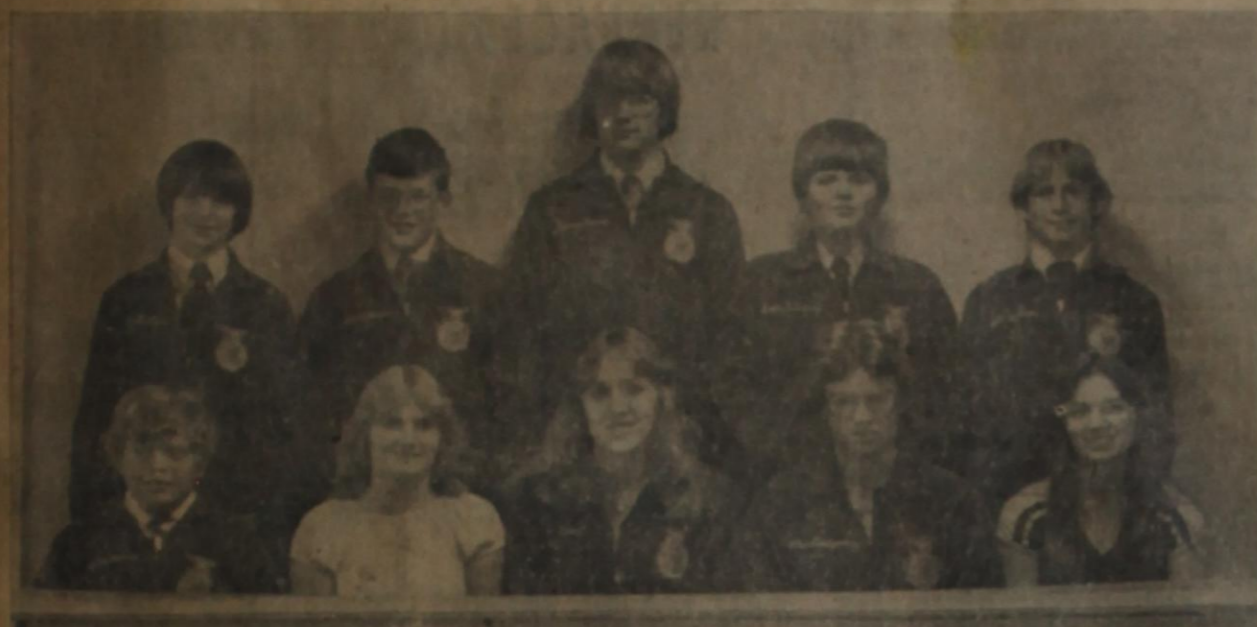
GREENHAND WINNERS —The Cross Plains FFA Greenhand Conducting Team participated in the parliamentary procedure contest of the Big Country District held at Cooper High School in Abilene recently. The team won first place qualifying them for