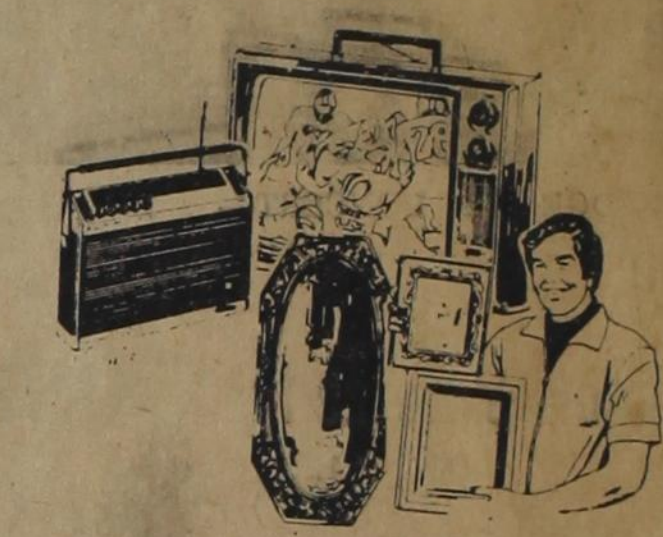
Radios, televisions, pictures, mirrors & lamps.

leg locks. Chairs are convenient for the younger members of the family Foam padded pillow seat. Strong riveted crossbraces. Contoured all