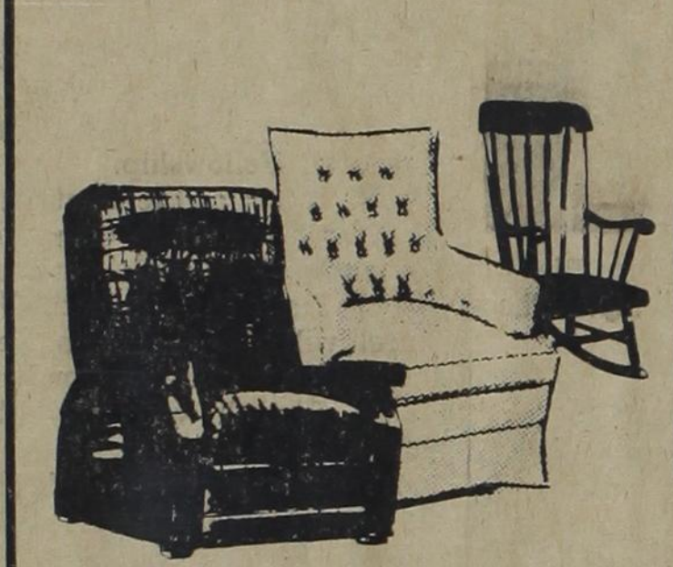
20% Off for the Holidays

Sleepers, sofas, chairs, rockers, & recliners