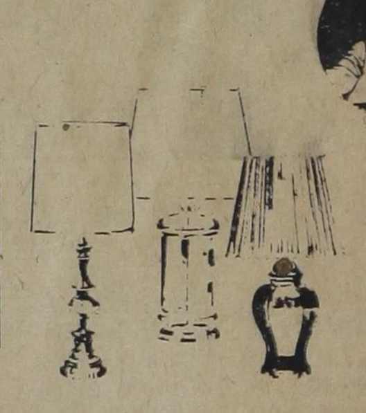
13.95 to 31.95 Reg. 24.95 to 57.95

Sleepers, sofas, chairs, rockers, & recliners