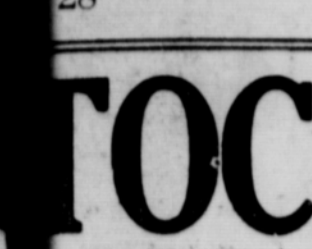
SEE HOW MUCH I SAVED AT RED & WHITE

PEANUT BUTTER - Quart BAKING POWDER, K.C., 50 oz. can HOMINY, (No. 300) can Gobbler brand, ea FLOUR, R & W, 48 lb. sack OVALTINE, R & W, 24 lb. sack small can