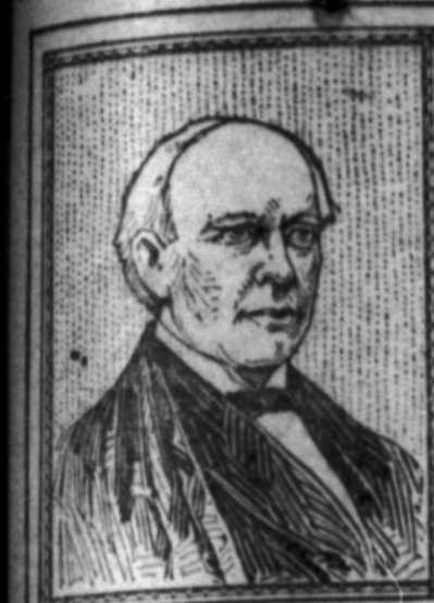
Salmon P. Chase