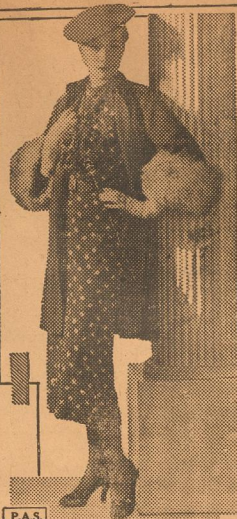
NEW YORK . . . Here's the first peek at Spring apparel, an afternoon ensemble in green. The woolen swagger coat in three-quarter length has its sleeves edged with natural lynx. The print silk crepe dress has an unusual scarf-like neckline.