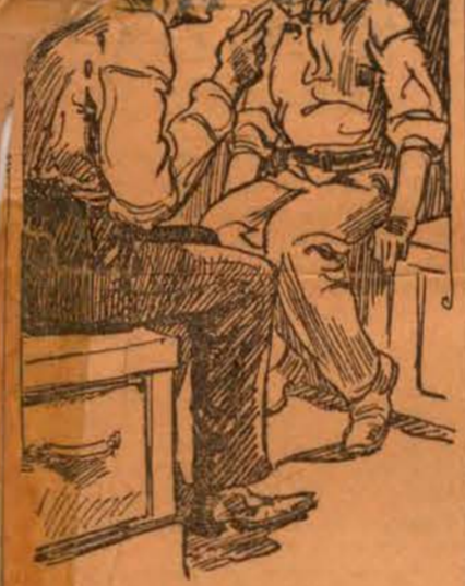
"Well fix Scraggsy."

"Well, gentlemen," (again McGuffey nodded approvingly) "I bet I get my twenty bucks back over them two Chinks," he announced presently.