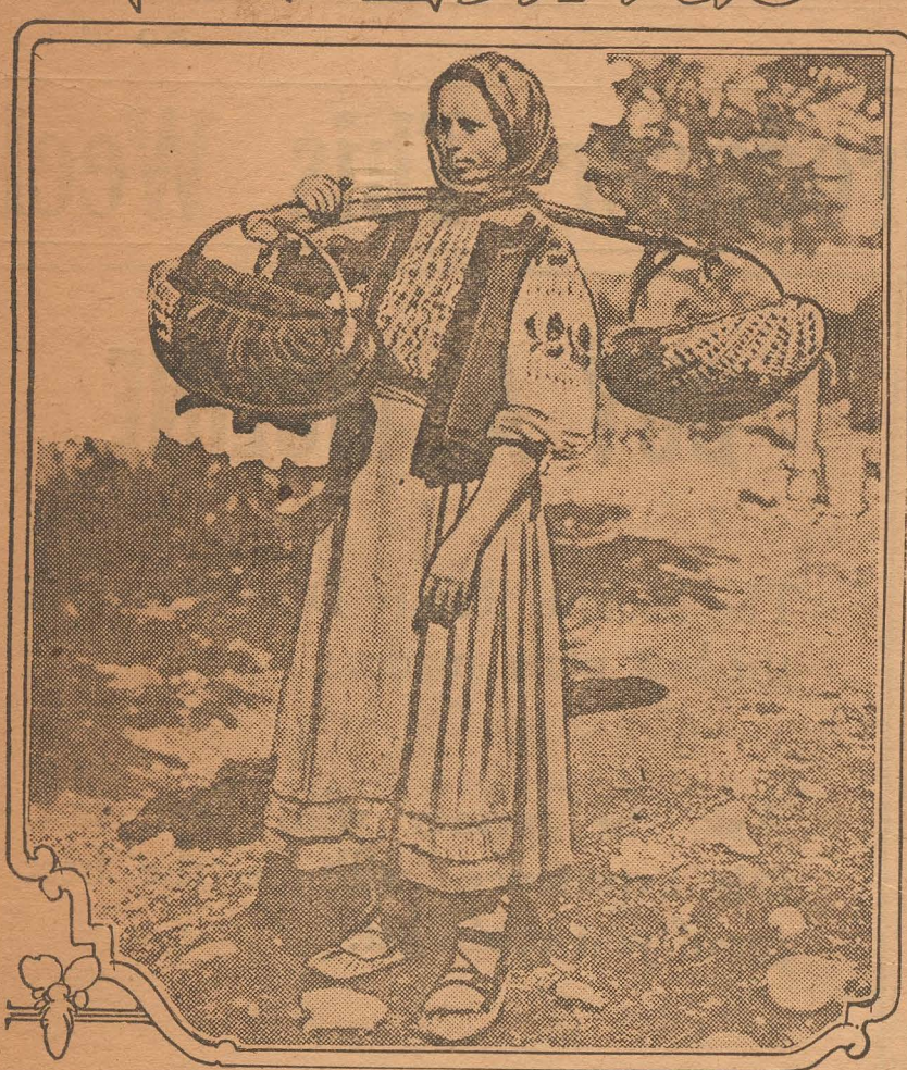
Rumanian Girl Coming From Market.

(Prepared by the National Geographic Society, Washington, D. C.)