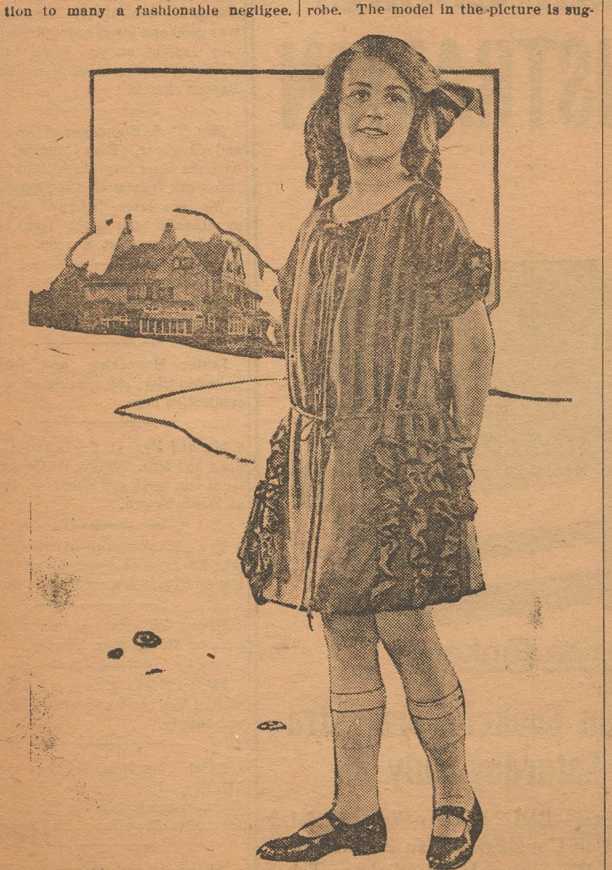
Forms a Pretty Picture.

chiffon tie confines this Greek-like It is a very practical idea to include at least one dark silk or crepe dress Rainbow treatment imparts fascina- in little daughter's vacation-time ward-