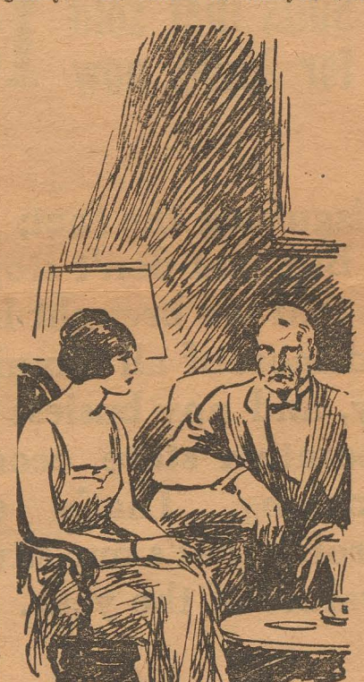
"I Do Love Him, Uncle Sandy, but I'm Afraid-"

The servant glared at him. "Kaya- sorbed. ma-San has taken a wife," she said, grimly. "He cannot be annoyed with