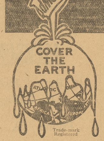
S-W Paint Products are sold the world over under this famous trade-mark

Plan a new color scheme for your home. Cost should be no hindrance, so why not start it at once? Come in and inspect our big, new Decorative Book for smart, new color suggestions. It is at your service.