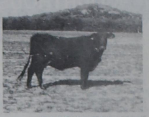
EAST CADDO PEAK Price 50¢