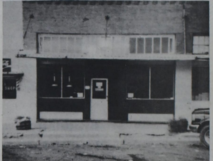
COUNTRY KIN — The remodeled store front compliments downtown Cross Plains.

We also have Texas Statehood T-shirts (large and extra large), lapel pins and posters for sale. For your easy holiday wrapping and mailing convenience we will have decorated boxes to put your goodies in. There is a large assortment of philatelic items and there is always that thoughtful gift of stamps, post cards and envelopes for anyone on your list that is hard to buy for.