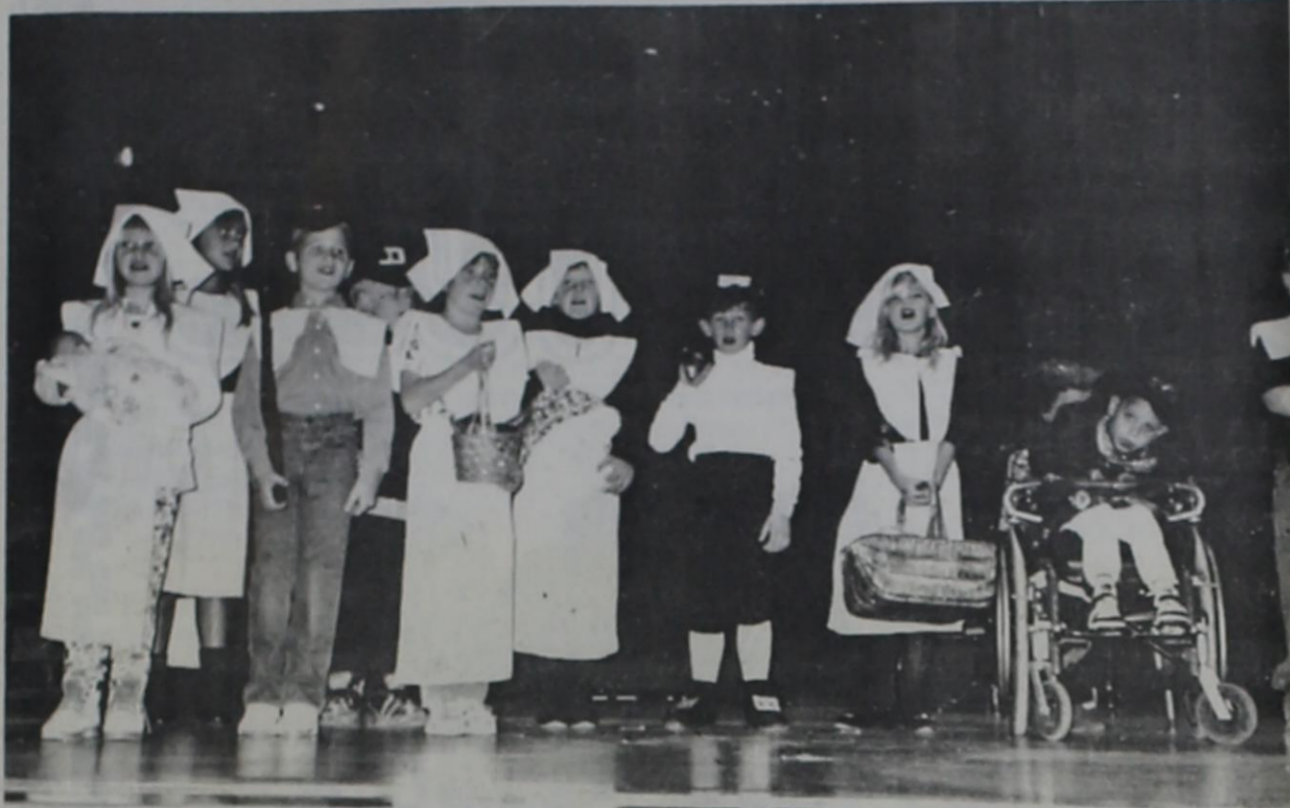
PILGRIMS—Second graders presented Thanksgiving play.