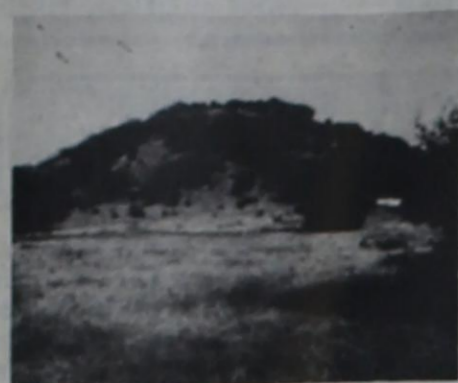
WEST CADDO PEAK