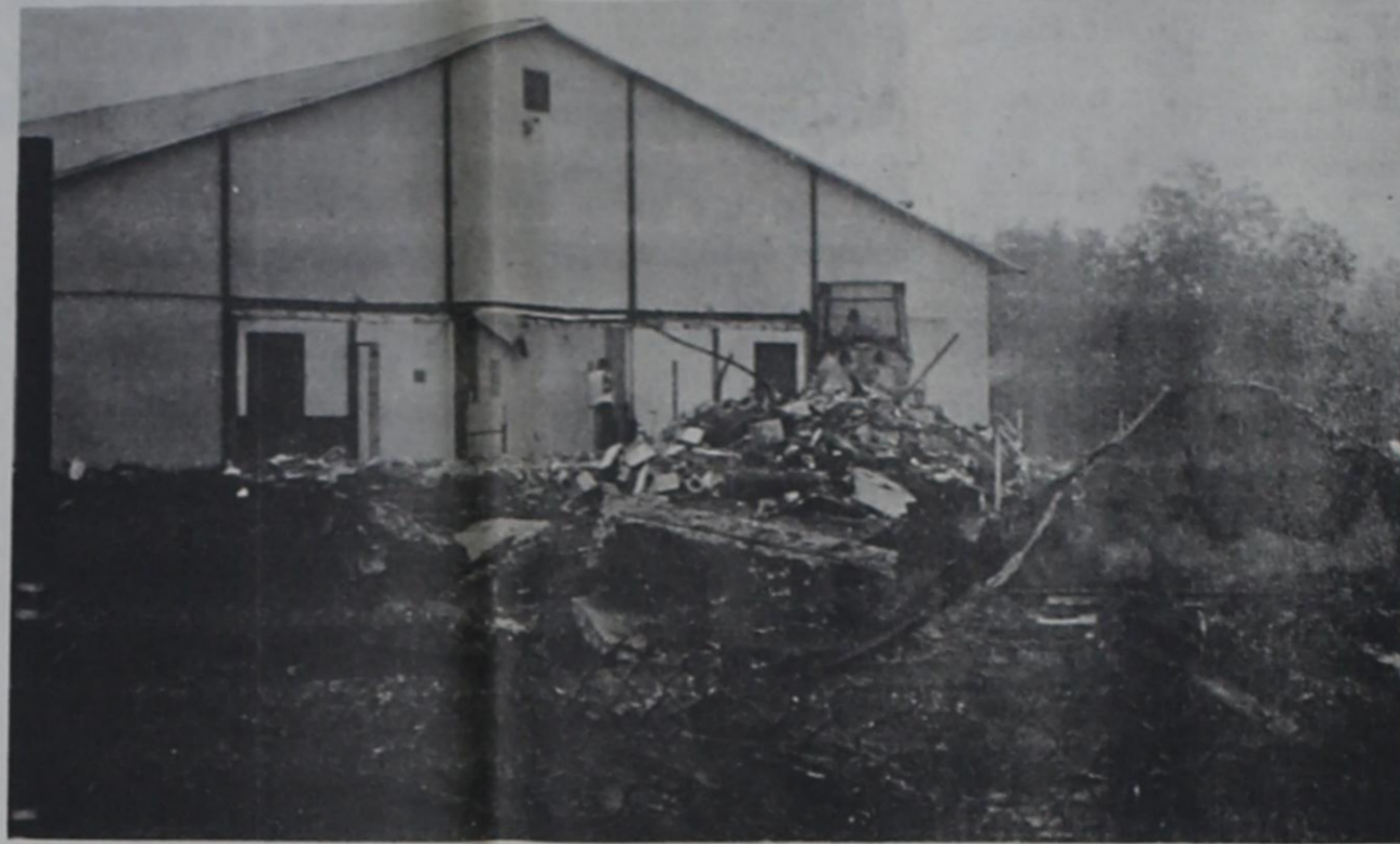
CONSTRUCTION BEGINS ON NEW GYM —This photo shows the removal of the entrance and concession stand on the front of the old gym. Currently the ground is being levelled for construction of the new facility to begin. Watch for photos updating progress.