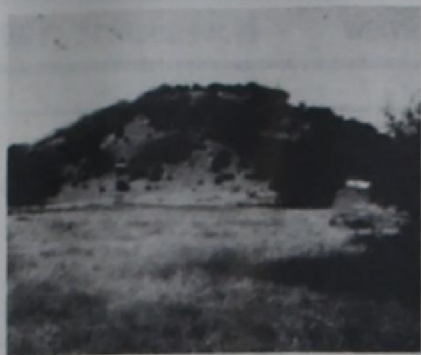
WEST CADDO PEAK