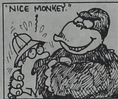
The tallest recorded height for a gorilla living in the wild is 6 feet, two inches.

The third annual Abilene Christmas Arts and Crafts Festival will be held November 25 and 26 in the Abilene Civic Center. More than 150 exhibitors will fill the main exhibit hall and conference center with original art, limited edition prints, and one-of-a-kind handcrafted items. Hours are Saturday from 10:00 a.m. to 6:00 p.m. and Sunday from noon to 5:00 p.m. There is no admission charge.