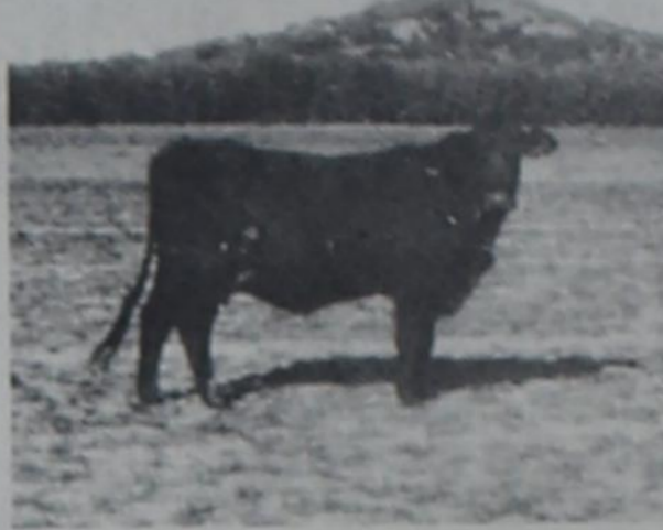
EAST CADDO PEAK Price 50¢