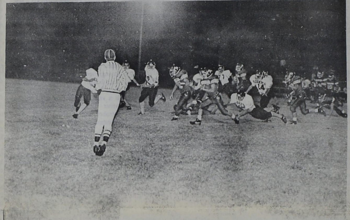
BUFFALO OFFENSE SCORES 27 POINTS AGAINST LOMETA

Come on out and support the Jr. High teams throughout the year.