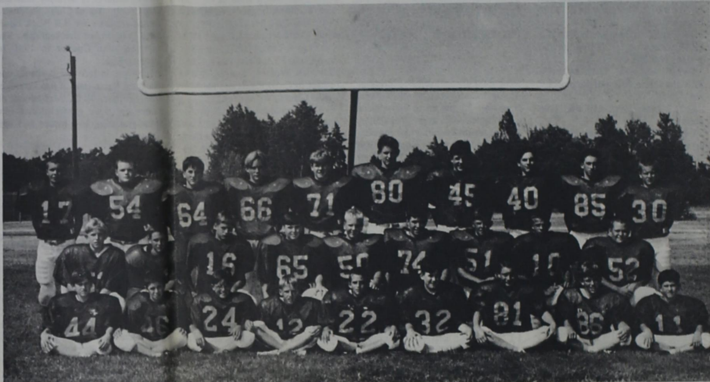
1995 JUNIOR HIGH FOOTBALL TEAM

Pictures may be taken with Santa Claus for $1 each. Candy and goodies will be distributed to all children.