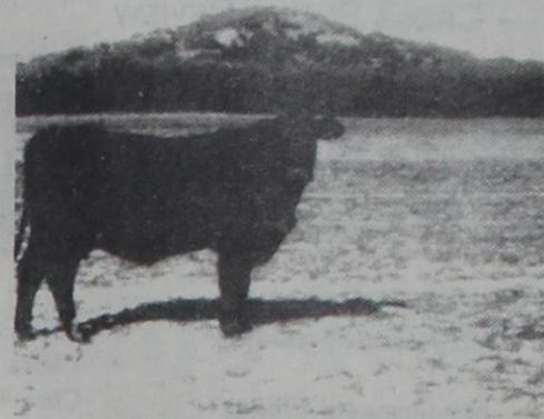
EAST CADDO PEAK Price 50¢