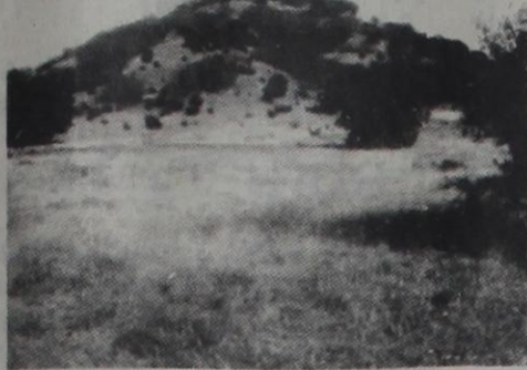
WEST CADDO PEAK