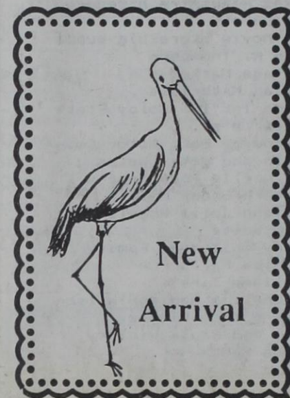
A Bonner is Born

The Phillips place was sold recently and I see work being done on the house, we'll be welcoming new neighbors soon.