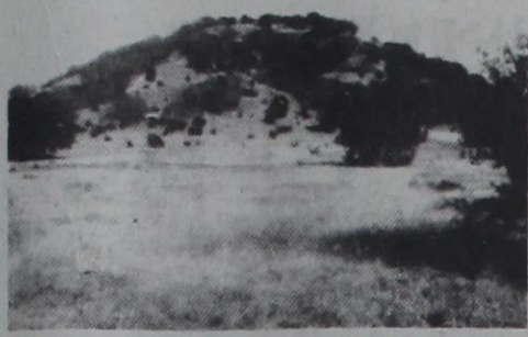
WEST CADDO PEAK