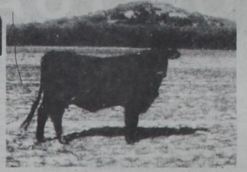
EAST CADDO PEAK Price 50¢