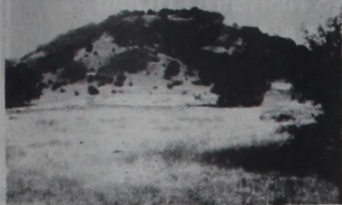
WEST CADDO PEAK