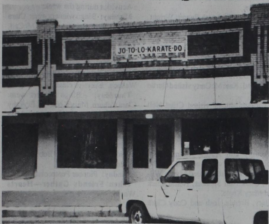
NOW OPEN—Jo-To-Lo Karate Do, located at 141 North Main is now open.