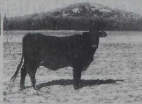
EAST CADDO PEAK Price 50¢