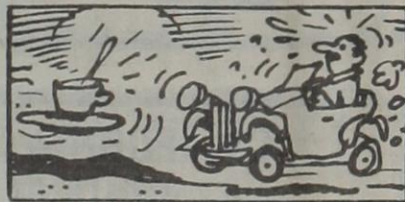
Kenneth Arnold filed the first official flying saucer sighting, June 24, 1947, while flying near Mt. Rainier.