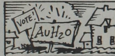
Senator Barry Goldwater's 1964 election slogans was AuH2O—the chemical symbols for gold and water.