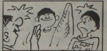
Some American Indian tribes believed it to be good luck to "marry" their fishing nets to little girls.

As in past years, the DPS will issue periodic reports on traffic fatalities throughout the Labor Day weekend.