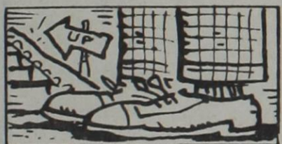
The escalator was patented in 1892.

ELLEN'S CLOSET DRY CLEANING — Laundry substation, open 9 to 5:30, Monday thru Friday, 725-6322.