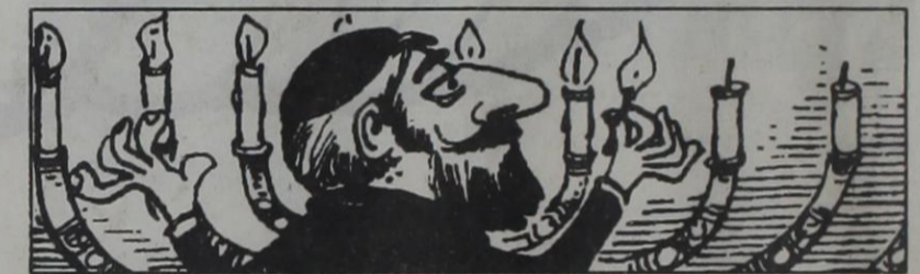
An old Hanukkah tradition in some places was to light all eight candles on the Menorah on the first night, and reduce the lights by one each successive night.

The next game is scheduled for after the holidays on January 6 in Lometa. MERRY CHRISTMAS AND HAPPY NEW YEAR!!