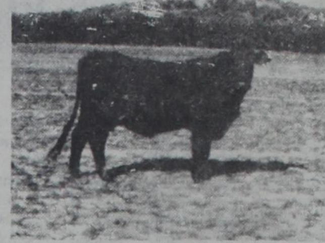
EAST CADDO PEAK Price 50c