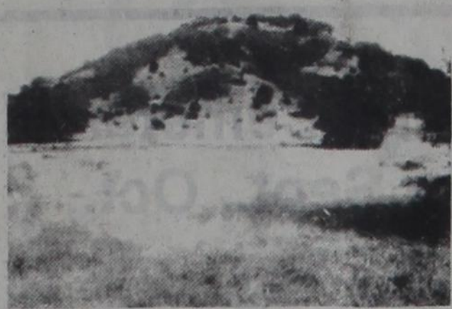
WEST CADDO PEAK