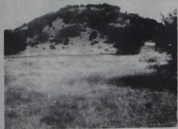
WEST CADDO PEAK Price 35¢