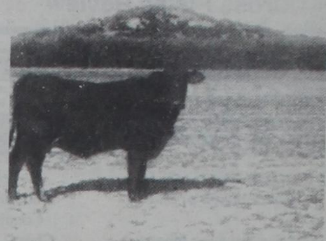
EAST CADDO PEAK Price 35¢