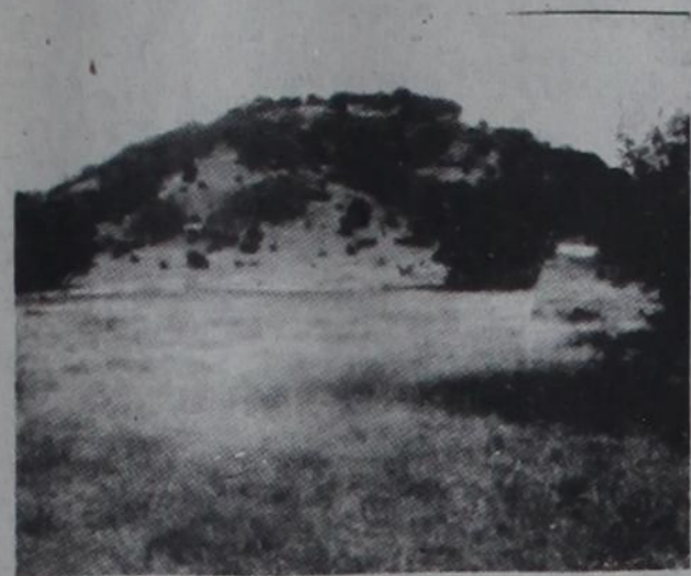
WEST CADDO PEAK Price 35¢