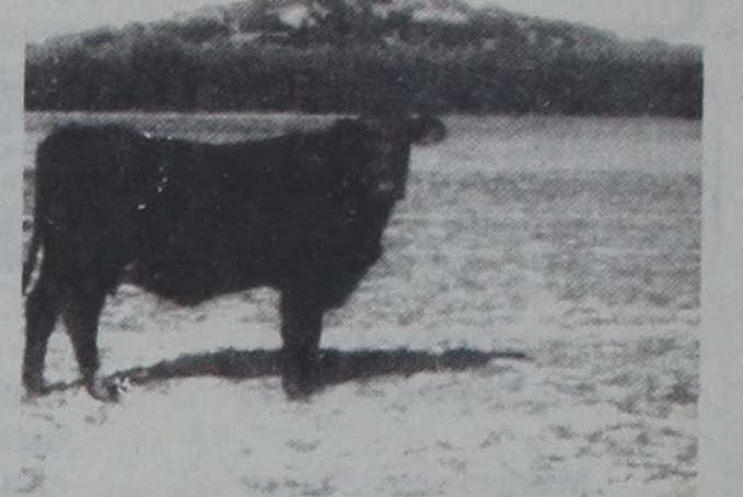
EAST CADDO PEAK Price 35¢