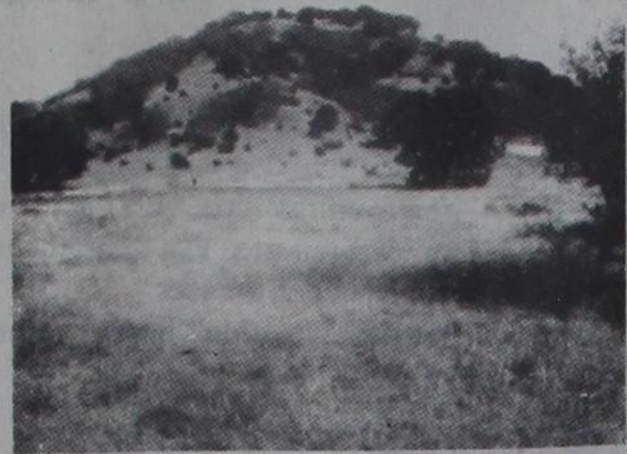
WEST CADDO PEAK Price 35¢