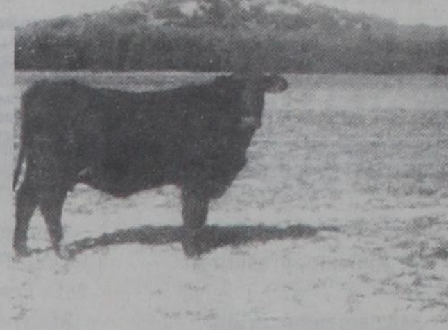
EAST CADDO PEAK Price 35¢