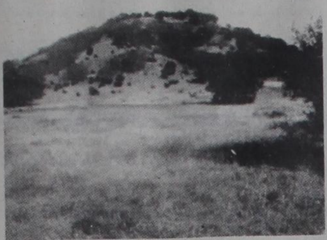
WEST CADDO PEAK Price 35¢