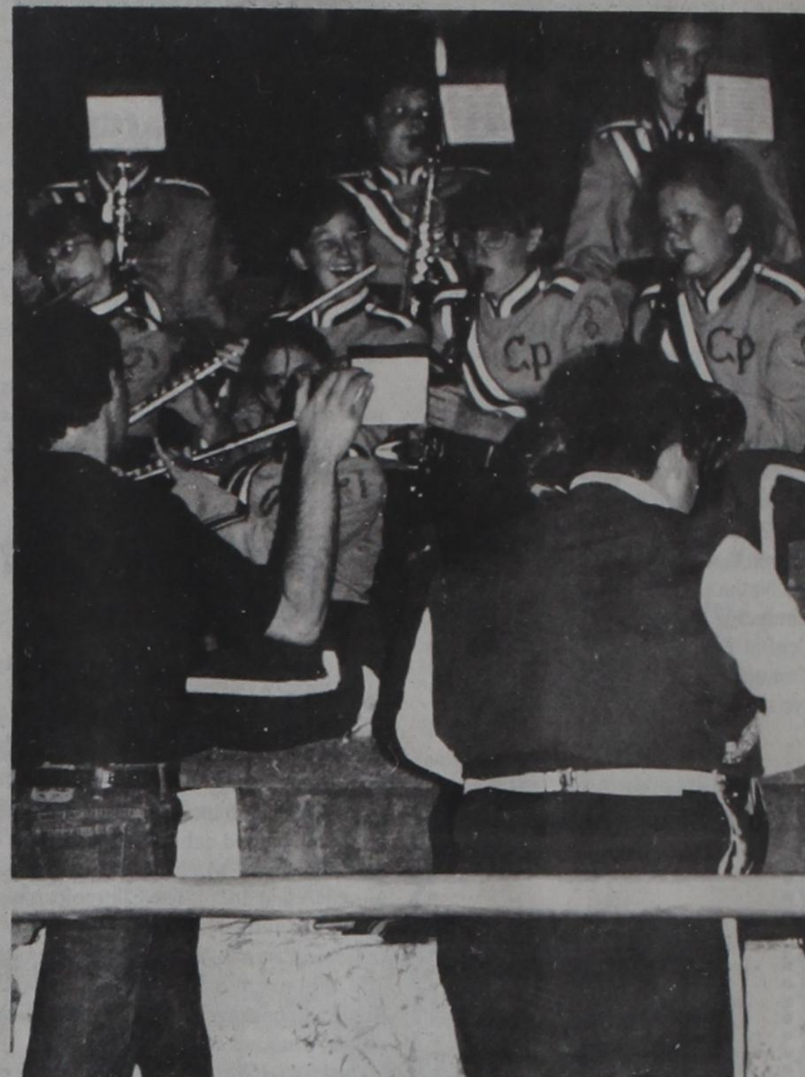
PERFORMING IN STANDS — The Buffalo Marching Band entertains the crowd.

FRIDAY — Hamburger, lettuce, tomato, and pickles, fries, Ice Cream, and milk.