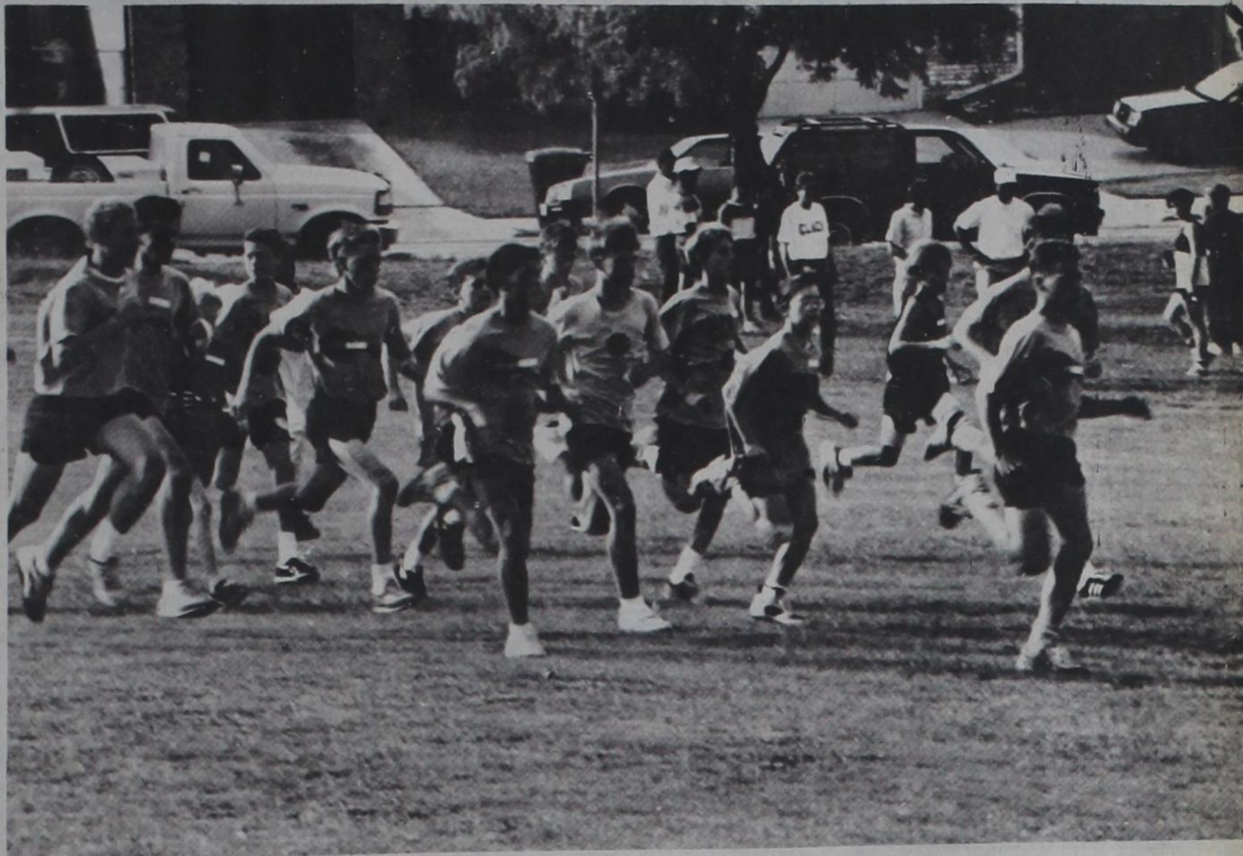
JUNIOR HIGH CROSS COUNTRY PARTICIPANTS