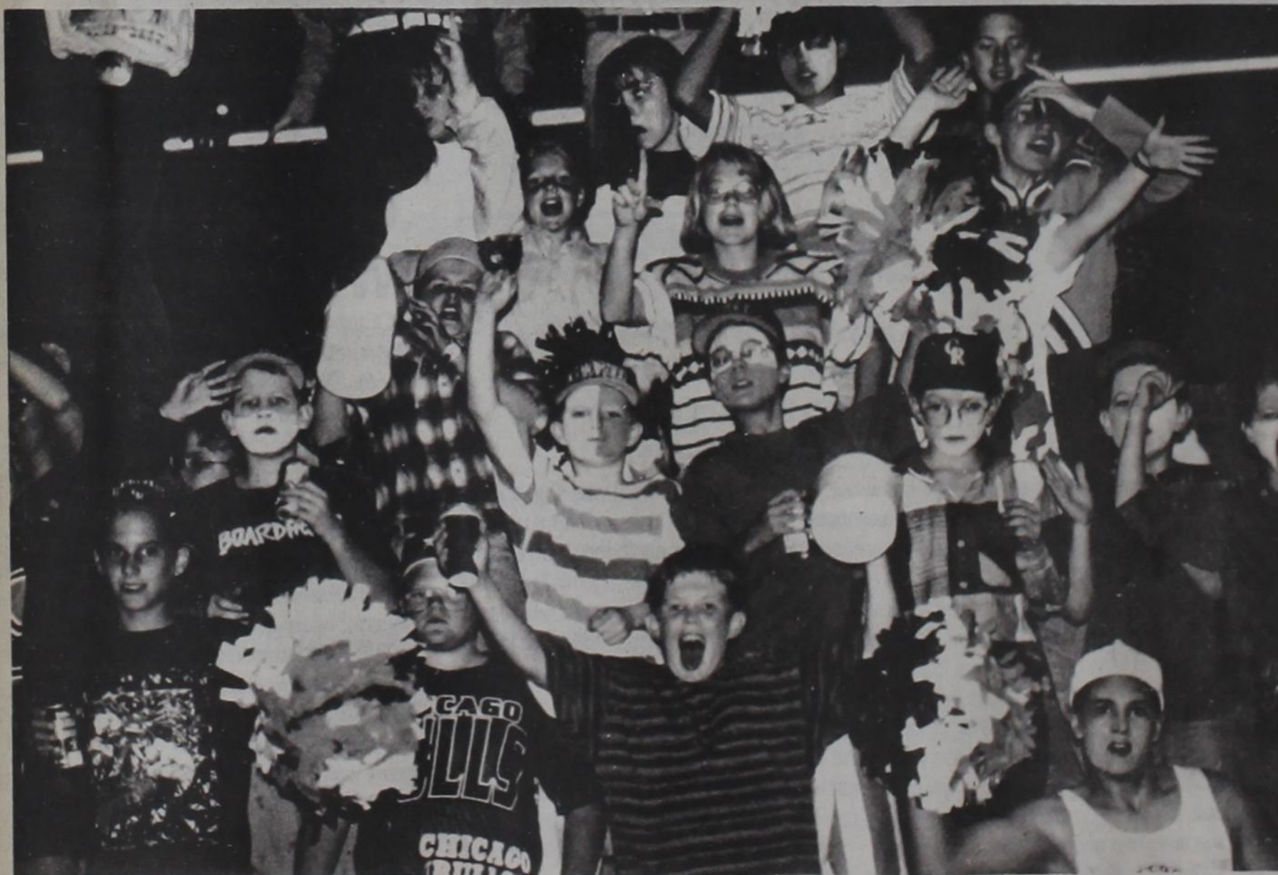
PAINTED FACES — A spirited student body cheered the Buffaloes at Friday's game.