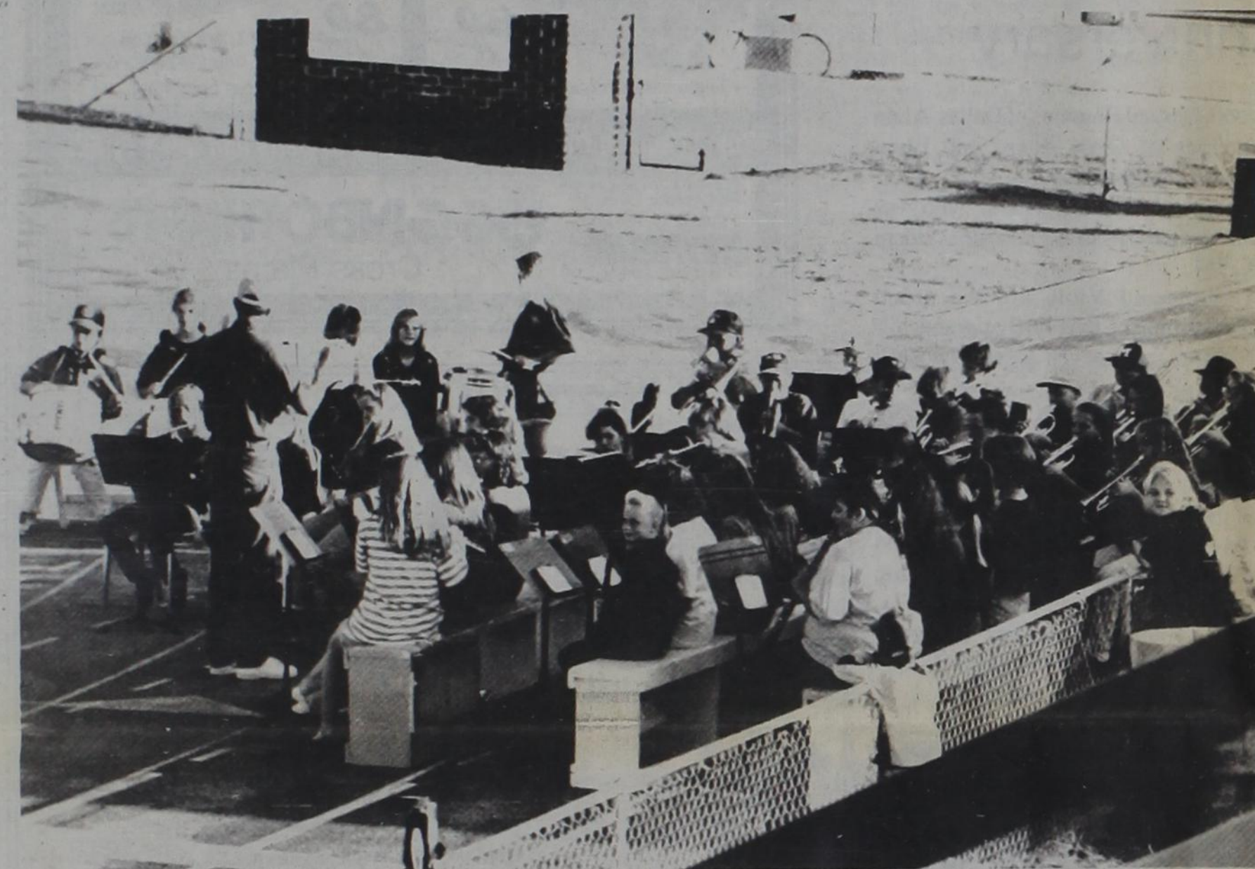
JUNIOR HIGH BAND PERFORMED AT THURSDAY'S GAME AGAINST GORMAN