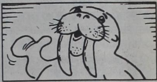
A walrus' tusks, actually its upper canine teeth, may grow to nearly 40 inches long.

*The avg. was figured on the 2 ACU meets and the 2 C.P. meets.