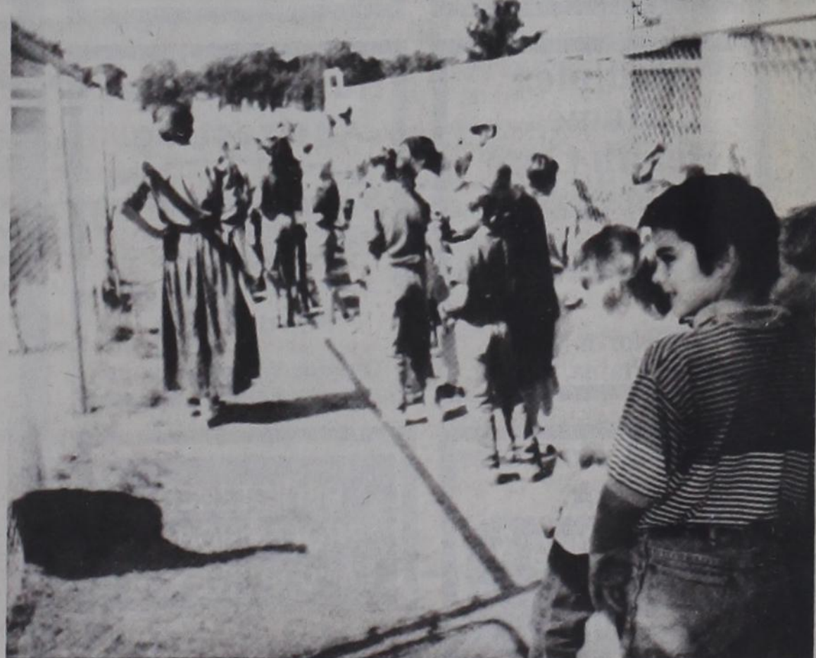
EMU WATCHERS — C.P. 4th graders recently visited the Dillard's Emu farm.