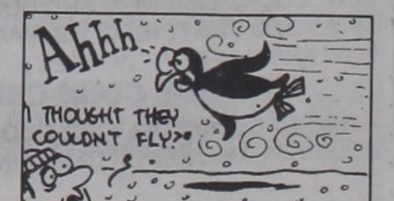
The windiest place on earth is Commonwealth Bay, Antarctica where gales reach 200 miles per hour.