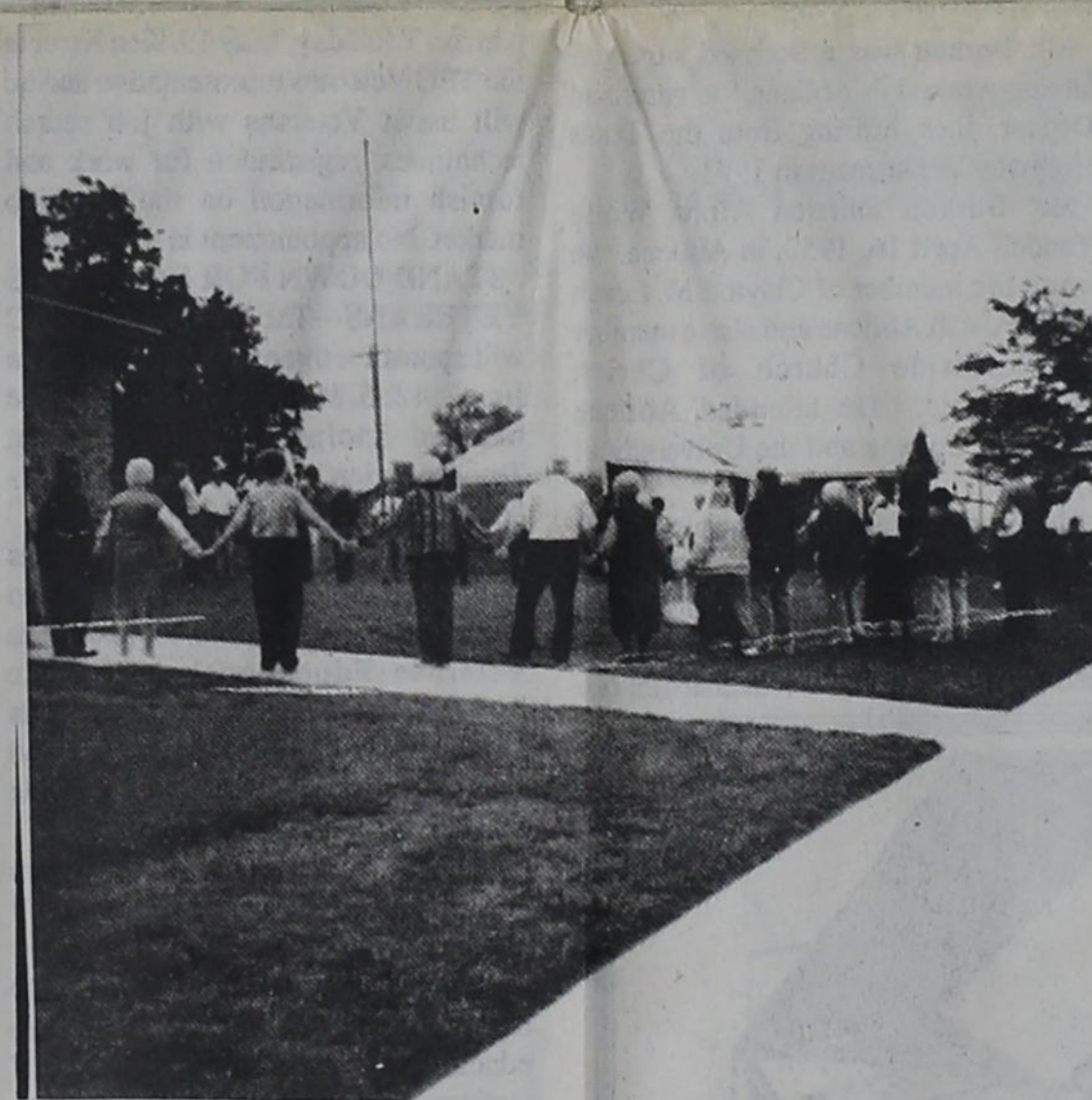
COMMUNITY RESIDENTS PRAY TOGETHER—Joined hands and

hearts, a circle of concerned citizens prayed for their country and home town.