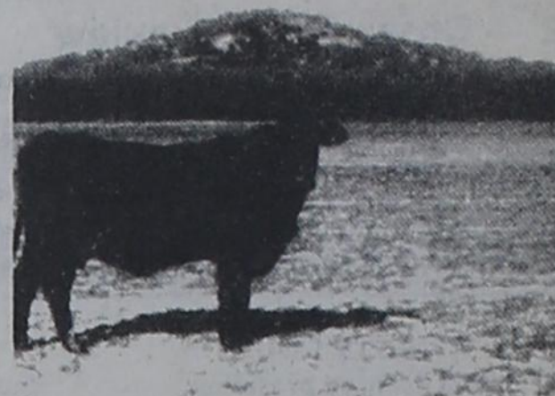
EAST CADDO PEAK Price 35¢