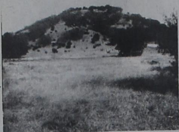
WEST CADDO PEAK Price 35¢