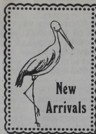
Damon Gage Preston

(1 block East of Downtown) Open 8am-9pm- 7 days wk. BAIRD, TX. PHONE: 854-1994