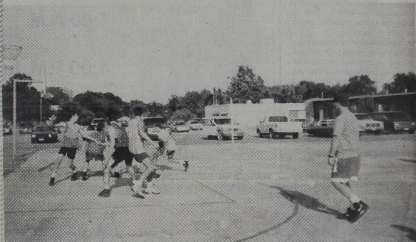
BOYS GET A GOOD WORKOUT