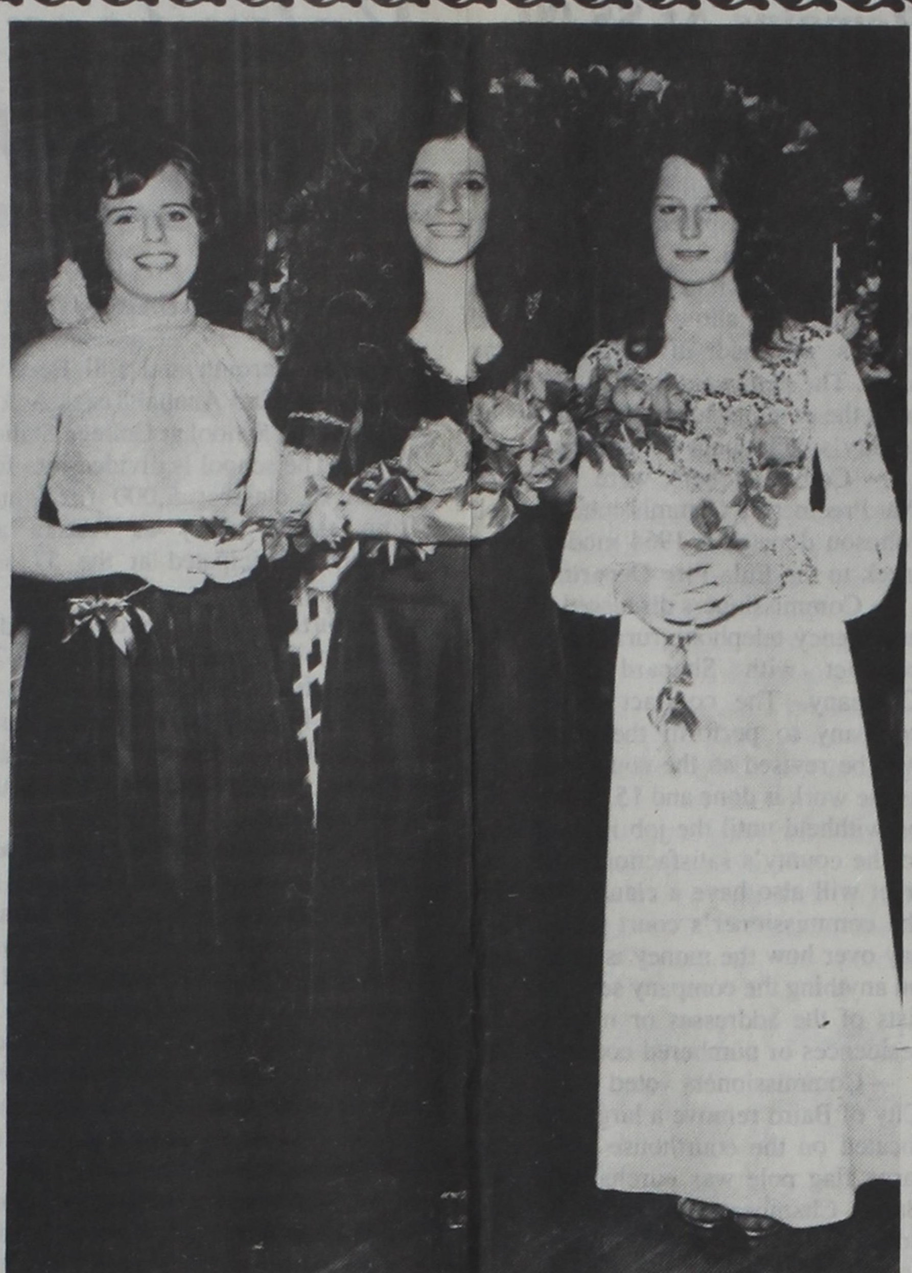
C.P.H.S. BEAUTIES — Don't forget about the 1991 Homecoming. Keep your weekend free for October 12. Come and visit with former classmates, teachers, coaches,

When you find yourself at the end of your rope, tie a knot and hang on.