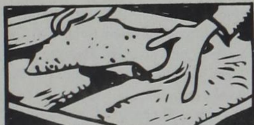
Add narrow plywood partitions lengthwise to deep drawers. Put most-uses articles on the half shelves.

The Abilene Social Security office is located at 142 S. Pioneer. The phone number is 698-1360 or you can call toll free 1-800-234-5772.