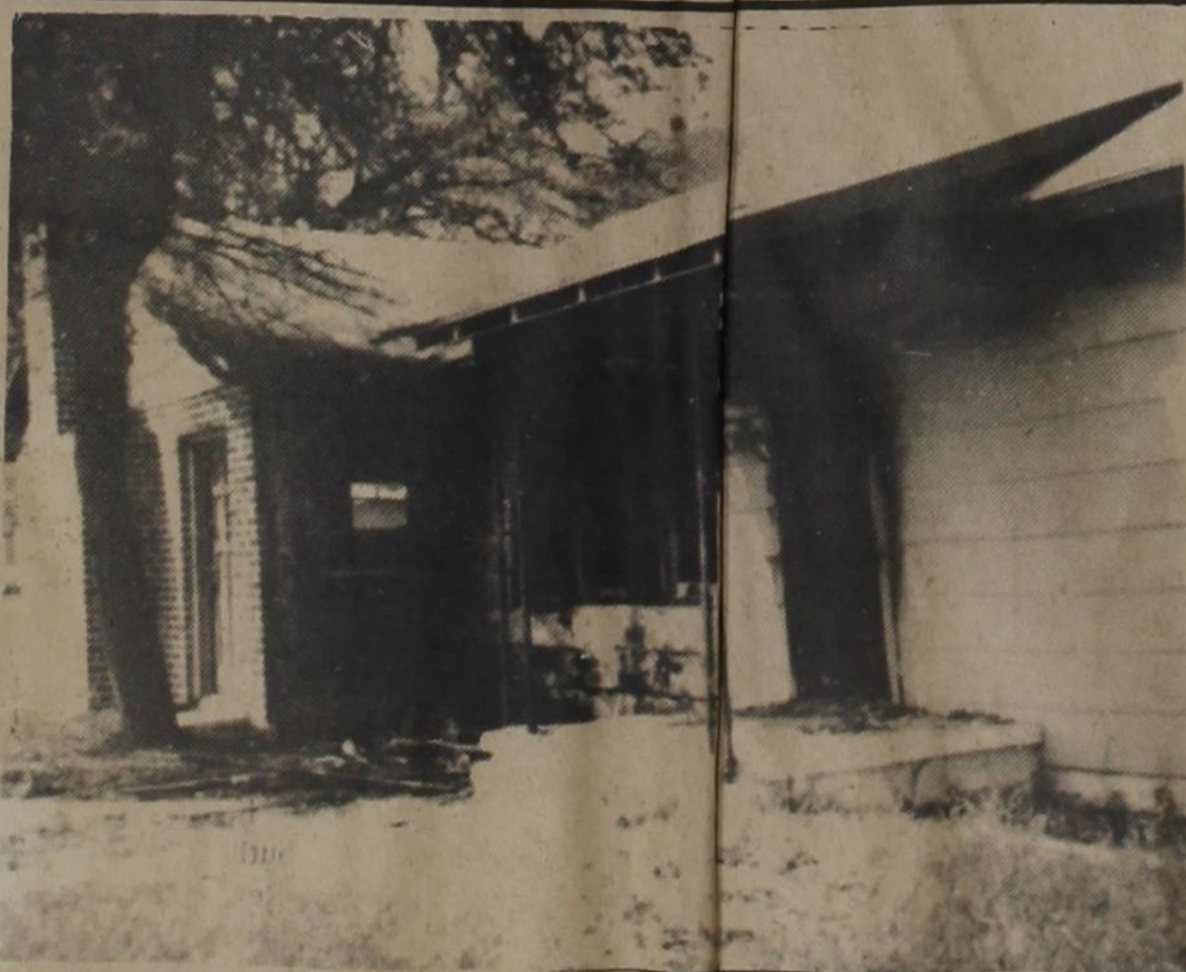
STRUCTURE SAVED — The house belonging to Edgar McNutt was saved from total destruction by the Cross Plains Volunteer Fire Department. The front section of the house received the most severe damage.