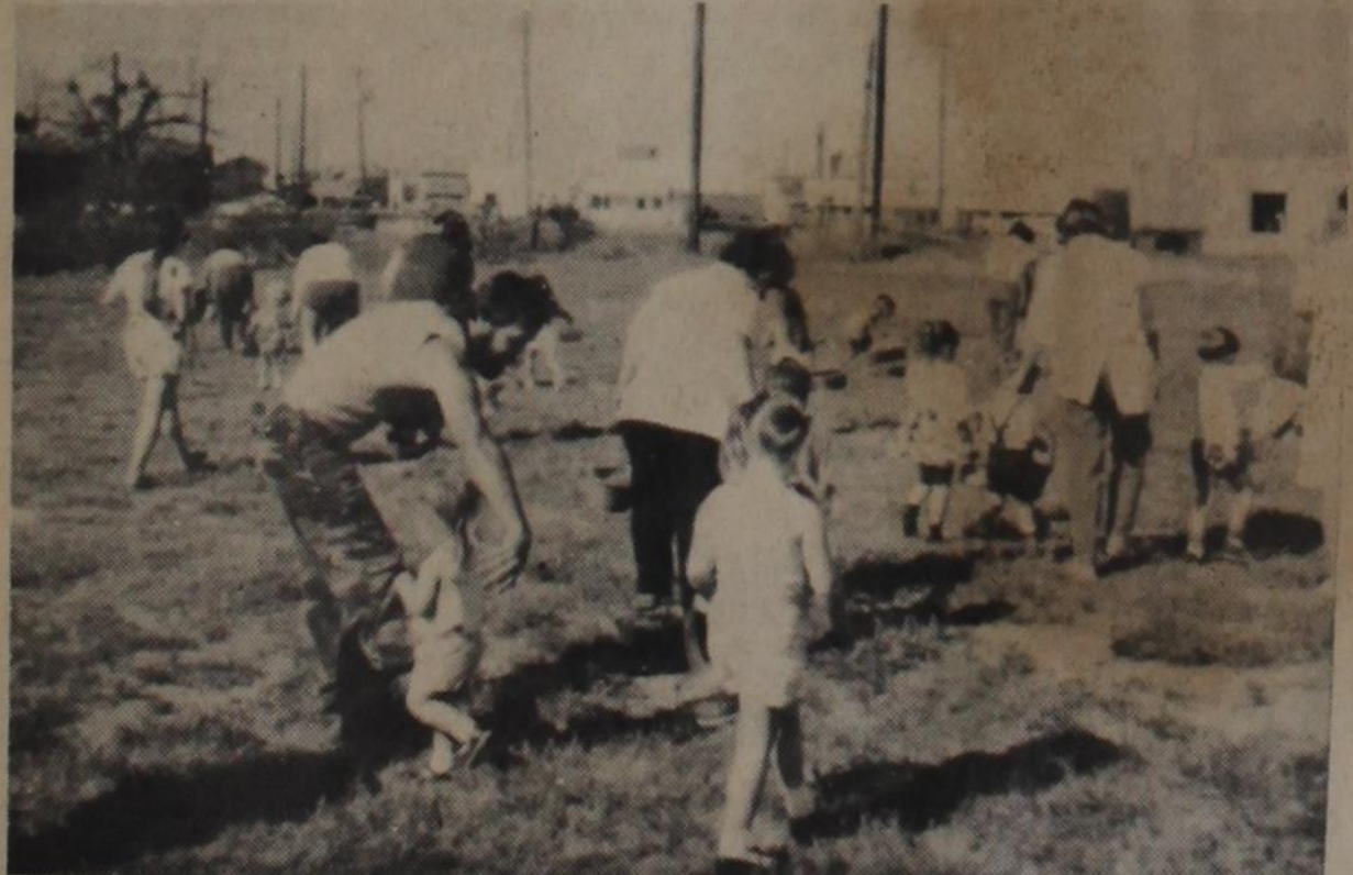
DQ EGG HUNT GREAT SUCCESS — Pictured are the 4 year olds and under, with the assistance of their parents.