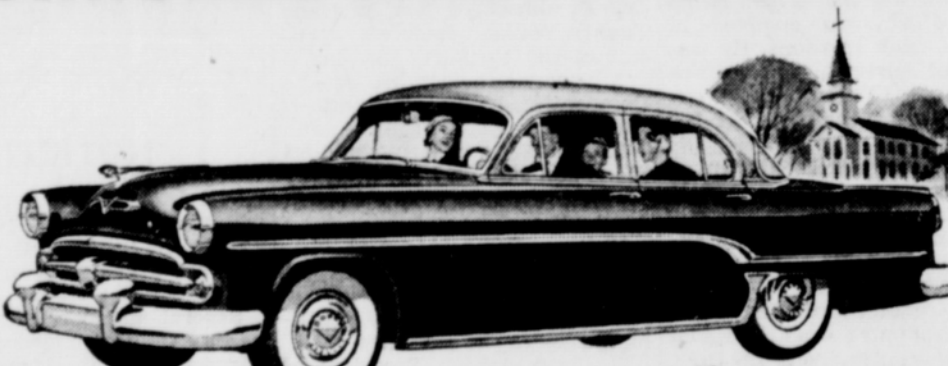
Dodge Royal V-8 Four-Door Sedan