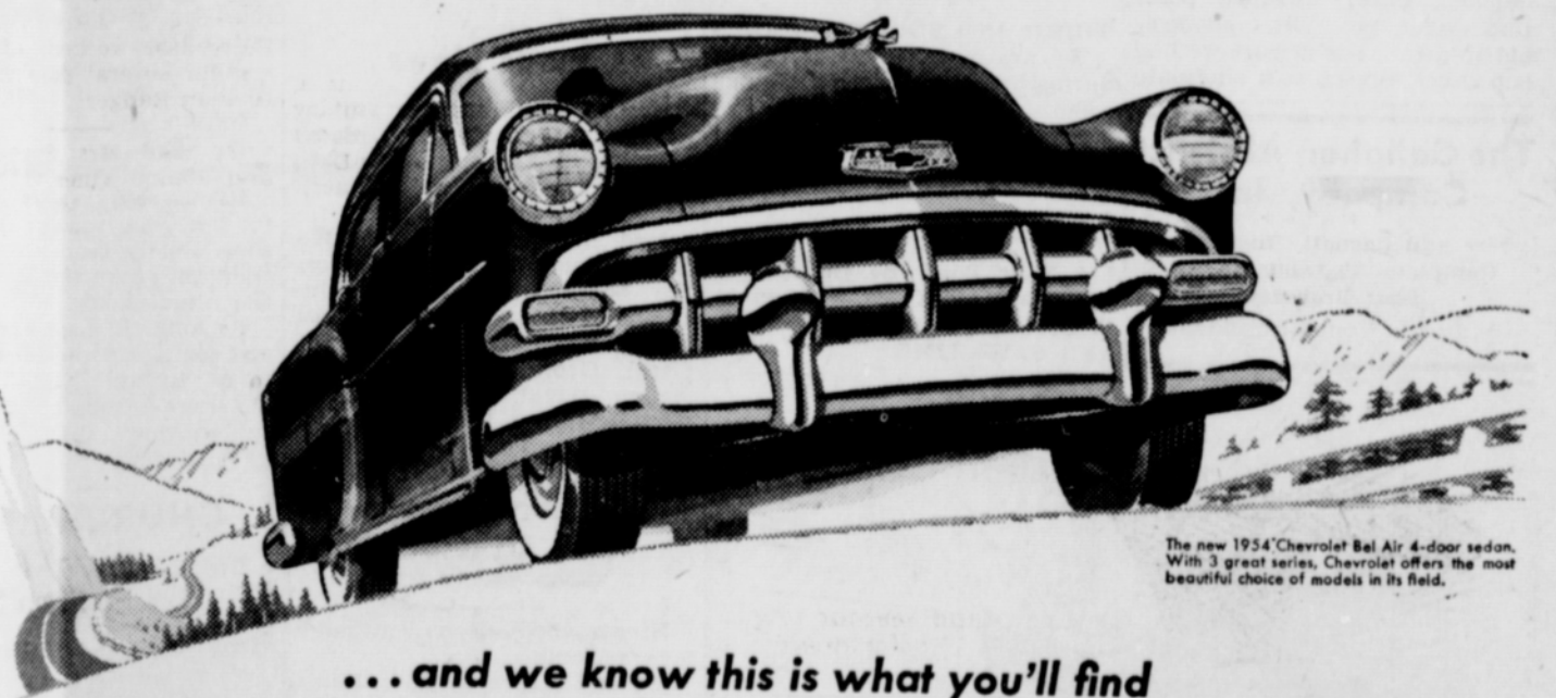
The new 1954 Chevrolet Bel Air 4-door sedan. With 3 great series, Chevrolet offers the most beautiful choice of models in its field.

... and we know this is what you'll find