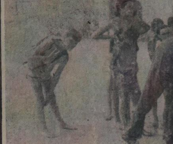
ALL IS FUN AT WOW YOUTH CAMP — Pictured are 29 young people who attended the Woodmen of the World Youth Camp, the week of June 20, at Lake Brownwood from a six-county area.