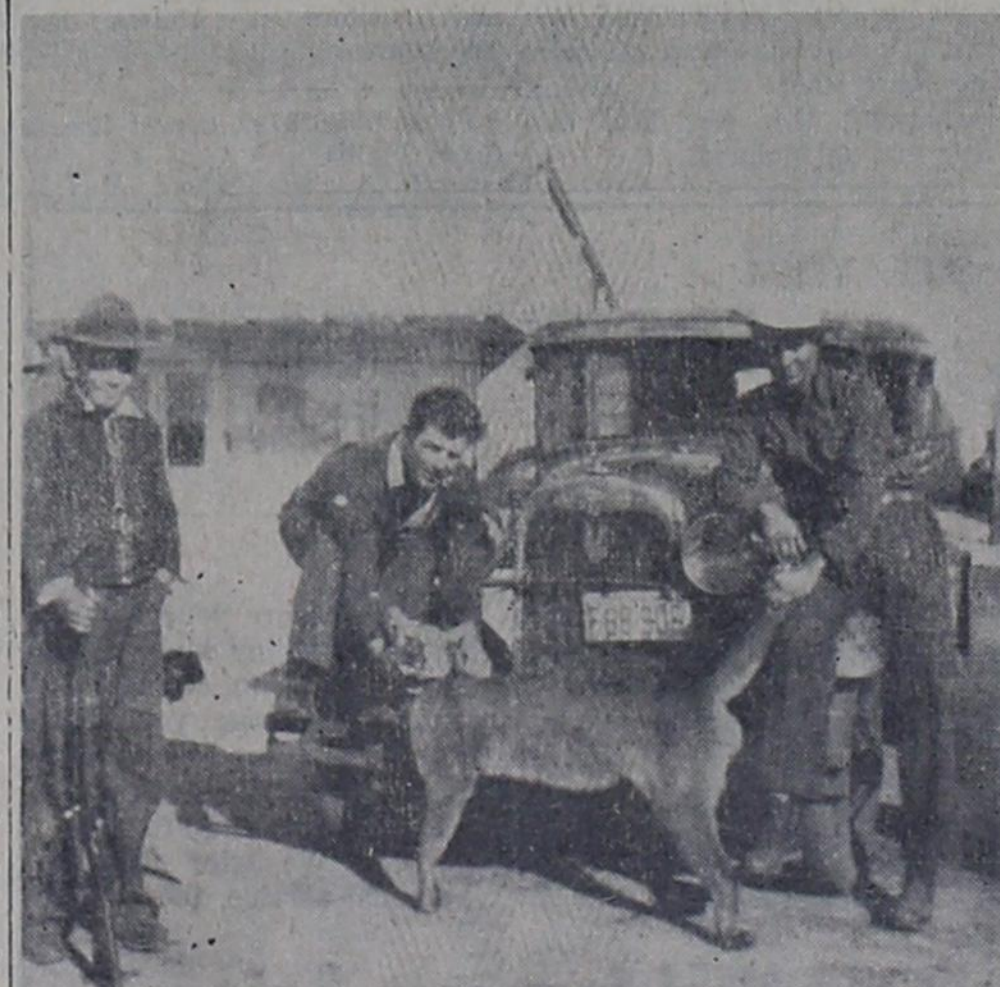
BIG CAT — Three unidentified young men boast of their kill in Cross Plains many years ago. Reportedly Mexican lions still travel through this area at certain times of the year.

TSTI is a state-supported technical and vocational institute offering more than 70 training programs in everything from industrial sewing machine mechanics to manufacturing equipment mechanics and nuclear technology. The institute includes four campuses located in Waco, Harlingen, Amarillo and Sweetwater.