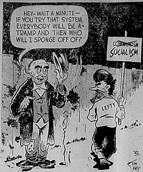
Even the Hobo Can't Be Fooled!