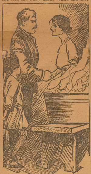
He Held Out a Large Hand That Was About as Soft as a Brick.

piant interness in the idid and expect it to thrive gh a combination of very cumstances. In the soil le's soul the acrid, noisome terness had withered. In smight, a fairer vegetation