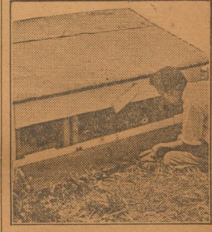
Chick-Saving Hatching Coop.

The coop can be used for hatching and brooding. It is divided by burlap frames into four compartments. The aim is to set four hens in the back