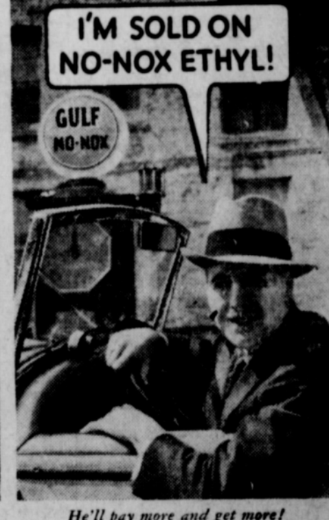
He'll pay more and get more!