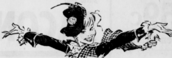
Bonnie, the Plaid Lassie®