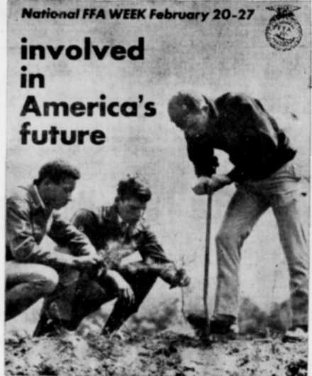
National FFA WEEK February 20-27