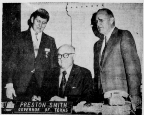
Through study of Agriculture in High School, and participating in activities of the Future Farmers of America organizations, many members are preparing themselves for promising careers in farming and rural leadership, or in one of the many off-farm agricultural occupations. During this, National Future Farmer of America Week, we each salute these hard working FFA members, and extend best wishes to each of them for success and happiness in the agricultural occupation of his choice.

Vocational Agriculture and the Future Farmers of America organizations contribute substantially to this program.