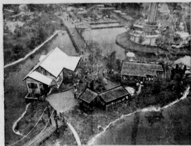
A TREASURE ISLAND OF FUN... Astroworld's new and exciting Fun Island features: The Swamp Buggy, Wacky Shack, and a wobbly Suspension Bridge. Astroworld will be open during the Fall weekend season, Sept. 5 (including Labor Day, Monday, Sept. 7) through November 1, $4.50 adults and $3.50 children.