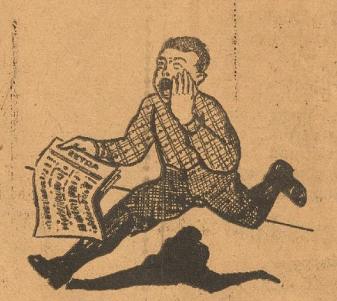
Tell Your Friends here's the opportunity for which they have waited. No prices on paper but prices made to buyer.