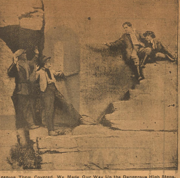
Keeping Them Covered, We Made Our Way Up the Dangerous High Steps

Del Mar's. A glance into the boat sufficed to tell the naturalist that the figure in it was only a dummy. He did not pause,