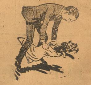
We'll let the Cat Out when we make prices on this Entire Stock of Merchandisc. One price to All. First come first served. Nothing reserved. Prices made to Buyers.