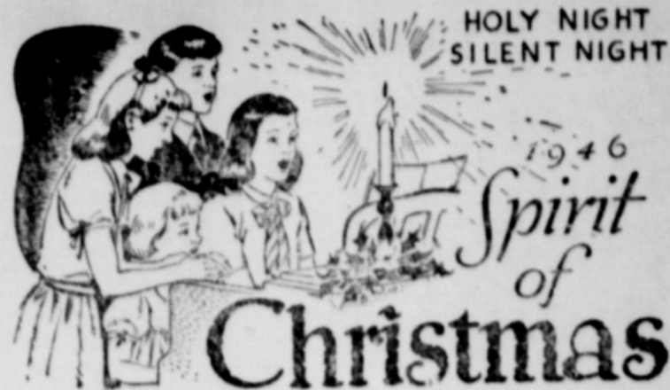
HOLY NIGHT SILENT NIGHT