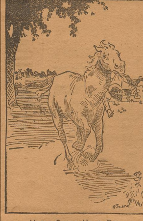
Horse Snaps Up a Boy.

Pet Animal Snaps Boy Rider Up in His Teeth and Tramples Him Under Foot.