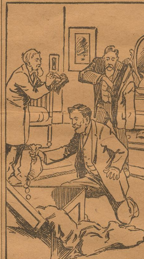
Find Miser's Fortune.