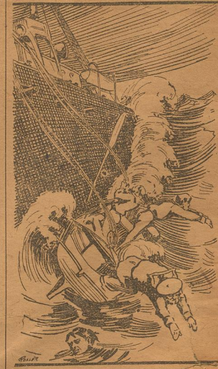
Crushed as Though She Had Been an

The shrill whistle of the boatswain The shrill whistle of the boatswain and his mates and the hoarse order: "Away there! You life boats away!" the officer and eight men, composing the life boat's crew, took their places in the boat and prepared to lower away. The boat used was the captain's gig, which hung at the starboard