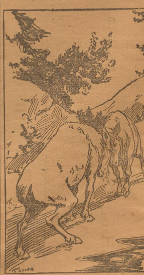
Dehorned Elk Fight.

Younger Buck Masters the Older in a Terrific Combat Before the Startled Herd.