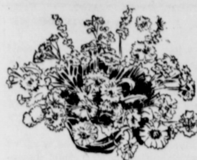
Our Sympathy Humoly Expressed