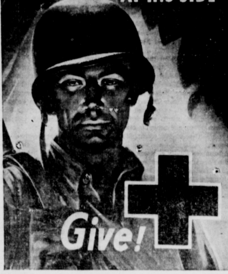
Through the Red Cross the American people serve the men of their Army, Navy, Marine Corps and Coast Guard.