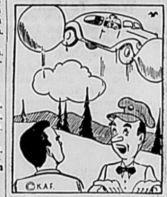
"Musta used too much bubble gum when I fixed the flats."

Mistakes can happen - but our SERVICE isn't one of them. We go out of our way to do the job quickly, dependably. For what your car needs - see us.